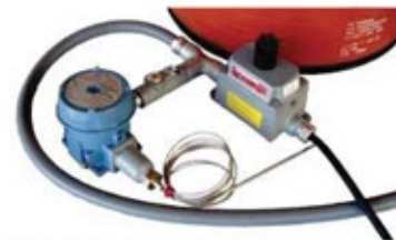
NEMA 7 Controller and High Temperature Limit Indicator Light