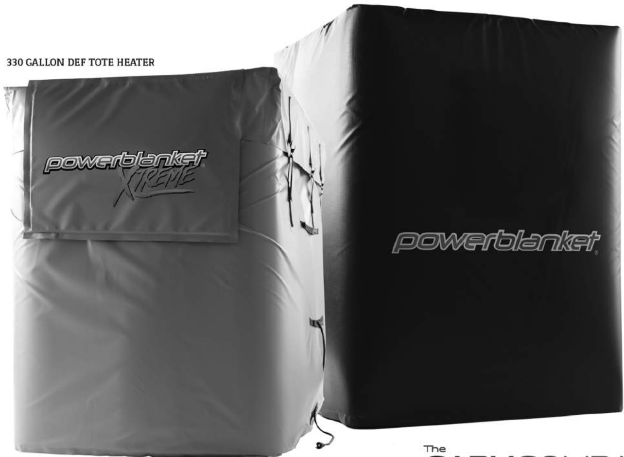
330 GALLON DEF TOTE HEATER