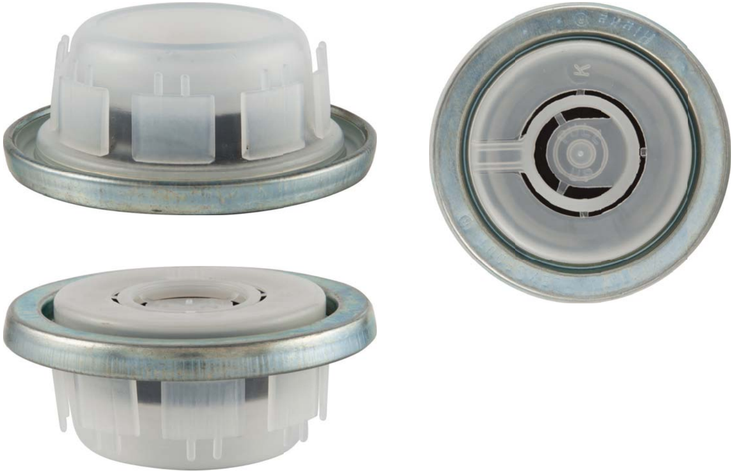
FS-10-8V-300-PV-21-P RIEKE FLEXSPOUT® Closure w/ Buna Vent