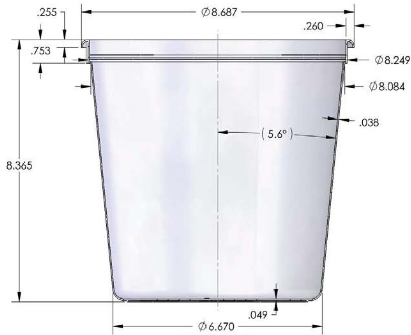
SECTION A-A SCALE 1 : 2