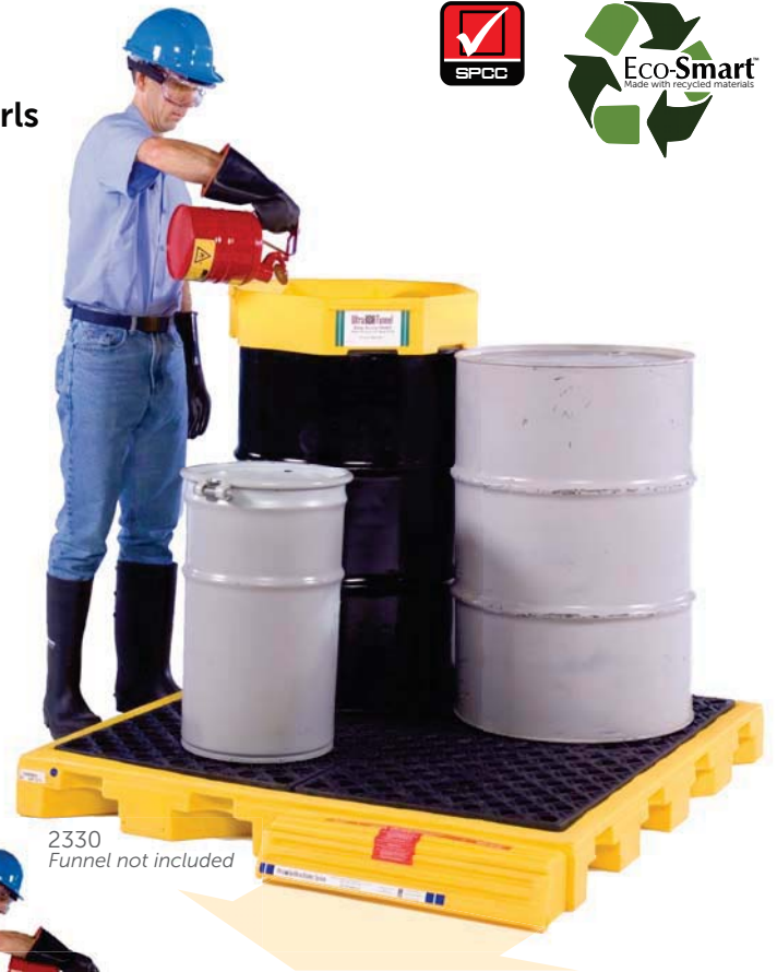
2330 Funnel not included