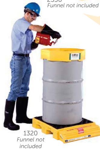
1320 Funnel not included

Rugged polyethylene bladder provides 66 gallons of additional containment.