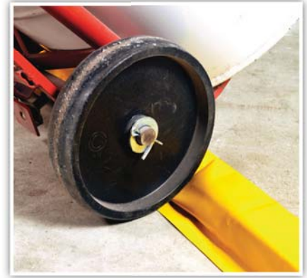
Foam-filled sidewalls springs back into shape after being stepped on or rolled over with light, wheeled equipment.