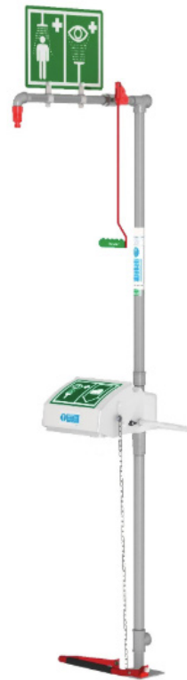
shown with optional treadle

Combination Safety Shower w/ Eyewash Station, Floor Mount, Closed ABS Bowl, Galvanized Pipe, Bottom Inlet