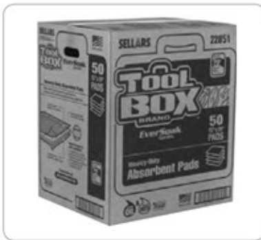
EverSoak® Heavy-Duty Pads Outer Case

Caution: Not intended for use with aggressive acids or caustics. Dispose of all sorbent materials in accordance with local, state and federal regulations.