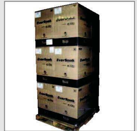
EverSoak® Brand Standard Rolls Master Case on a Pallet