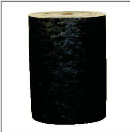
EverSoak® Brand Standard Rolls