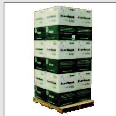
EverSoak® Brand Preferred Rolls Master Case on a Pallet