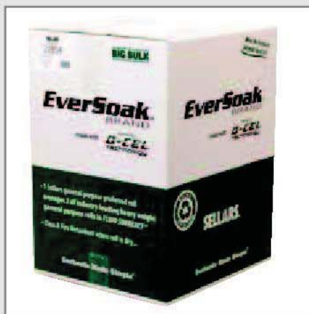
EverSoak® Brand Preferred Rolls Master Case