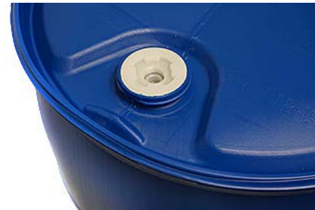
Buttness Threaded Plug