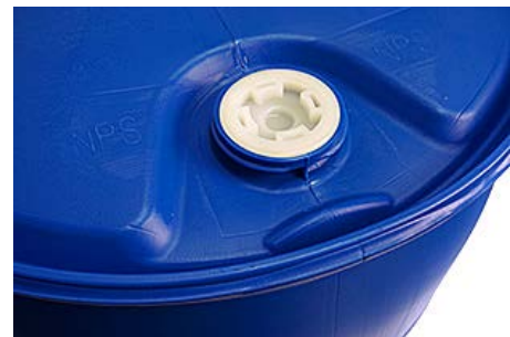
NPS Threaded Plug

Our 55 gallon tight head drums are extremely strong and compatible with most drum handling devices. In addition, our drums include a bottom handhold for easy use. We are FDA compliant and Kosher certified.