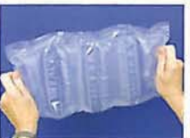
CELL-O® EZ film (4" x 8" size) for small void fill