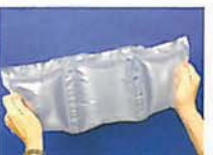
CELL-O® EZ film (8" x 8" size) for larger void fill and to block and brace