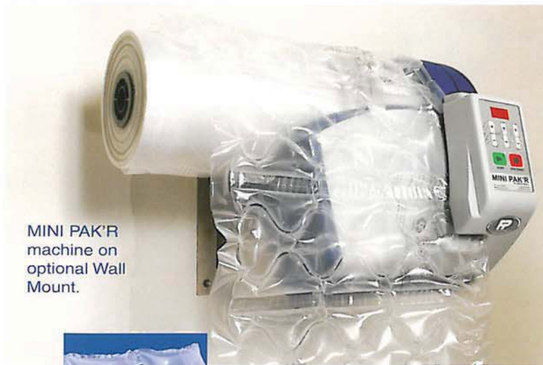
MINI PAK'R machine on optional Wall Mount.

The intelligently designed MINI PAK'R™ machine uses RFID technology to automatically select the right settings for the film you chose. Operation is simple: plug in the MINI PAK'R machine, load film and it's ready to go.