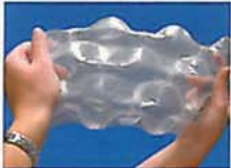
NOVUS Quilt-Air® Large film for void fill and wrapping