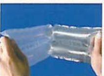
NOVUS Supertube® film for void fill and wrapping