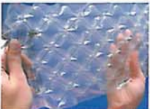
NOVUS Quilt-Air® Small film for interleaving and wrapping