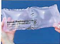
NOVUS Double Cushion® film for large void fill and to block and brace

The intelligently designed MINI PAK'R™ machine uses RFID technology to automatically select the right settings for the film you chose. Operation is simple: plug in the MINI PAK'R machine, load film and it's ready to go.