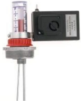
Direct Mount Alarm