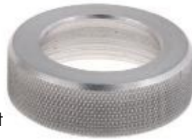
Aluminum Lock Nut

Glass Calibration- The internal piece of the calibration becomes glass. Provides protection from heat, fumes, weathering, and also helps with passing fire inspections. (part # add -GLC)