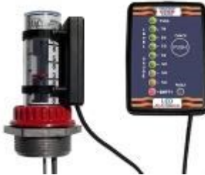
Led At A Glance